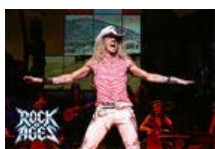
Rock of Ages May 23, 7:30PM @Paramount Theatre