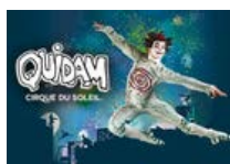
Cirque du Soleil: Quidam June 09, 5:00PM @U.S. Cellular Center