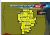
Severe storms in Eastern Iowa possible tonight,