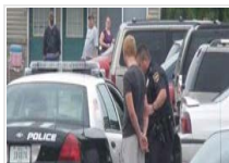
Outstanding arrest warrants