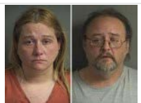
Couple accused of stealing jewelry from Iowa City ...