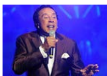
CANCELLED: Smokey Robinson June 07, 8:00PM @I Wireless Center