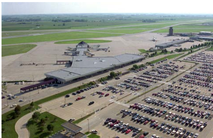
Construction of a new taxiway at The Eastern Iowa Airport may be pushed back to the next fiscal year due to a transfer of Federal Aviation Administration funds. (The Gazette)

Construction of a new taxiway at The Eastern Iowa Airport may be pushed back to the next fiscal year due to a transfer of Federal Aviation Administration funds to halt furloughs and keep air traffic controllers on the job.