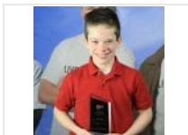
United Way of East Central Iowa honors volunteers