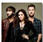
Lady Antebellum June 01, 7:30PM @U.S. Cellular Center